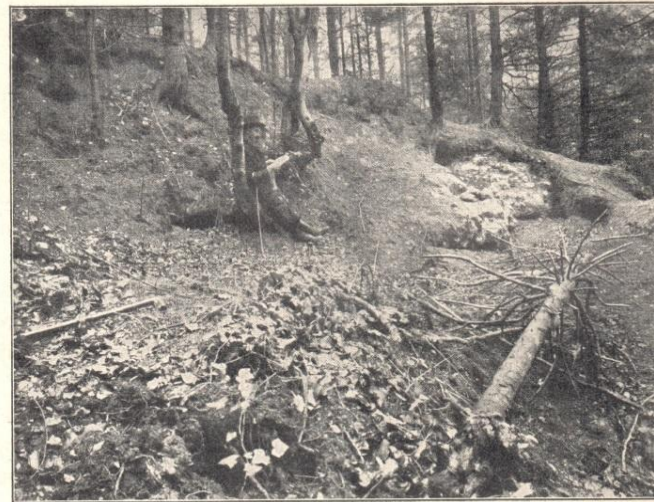
Reste der Burgruine Jenis, zwischen Jns und Erlach, aufgenommen 1907.